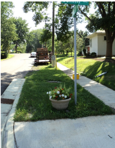
Left: The site before the rain garden was installed.

A 275 sq ft rain garden was installed around a beehive catch basin in the road right of way with permission from the City of Center City. The rain garden will capture stormwater runoff from Mobeck Avenue and parts of the neighborhood uphill from the site.